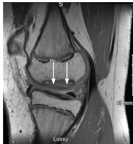
Figure 2 MRI view of an OCD lesion of the knee.

like in running and jumping for the knee and ankle; or throwing in the elbow) is also thought to play a role in causing OCD.